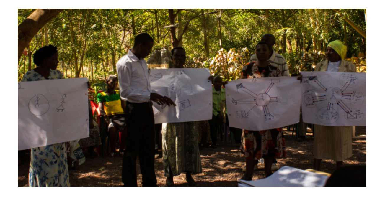
Song for Empowerment Leadership Map at Same workshop