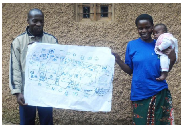
A young couple in Rwanda sharing their GALS vision journey

Building on a successful pilot project in Uganda, Oxfam Novib and IFAD extended their collaboration on the community-led Gender Action Learning System (GALS) for market/value chain development – a household methodology aimed at pro-poor wealth creation and gender justice. Since January 2012, Oxfam Novib has worked with 10 civil society partner organizations in northern Uganda, Rwanda and Nigeria to adapt GALS in their local contexts, addressing financial services, farmer training, business development services and market linkages for cereals, pulses, fruits, cocoa and vegetables. The objective is for potentially vulnerable women and men to develop the necessary skills through peer capacity building and action learning. In turn, they can negotiate a better position in value chains and achieve sustainable, equitable, ‘win-win’ collaboration with other stakeholders.